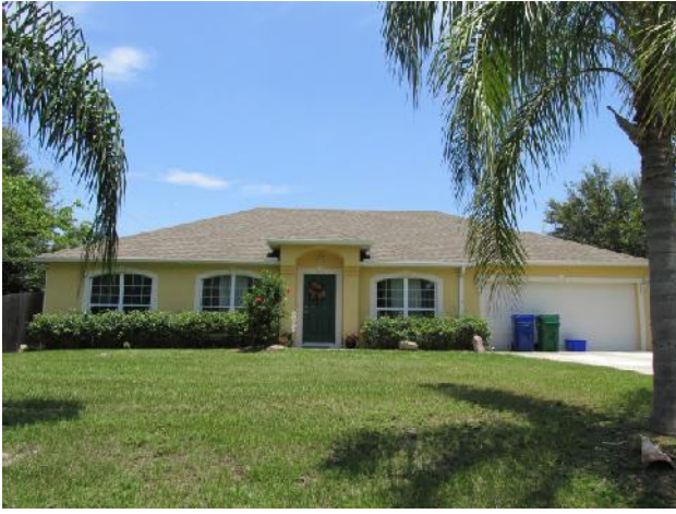
Front of Home