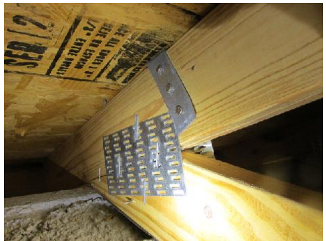
Single strap west of truss