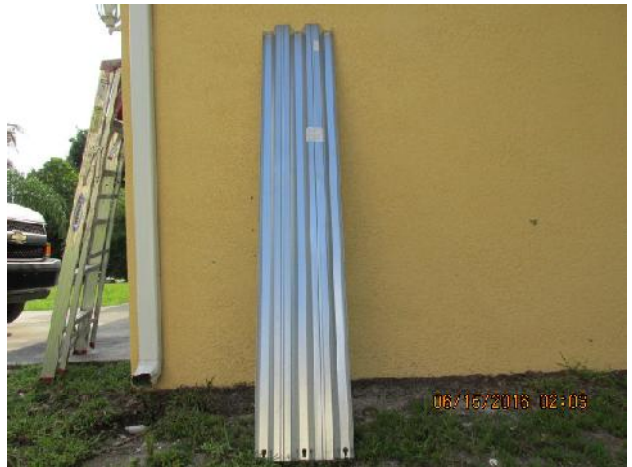
Class A hurricane shutter