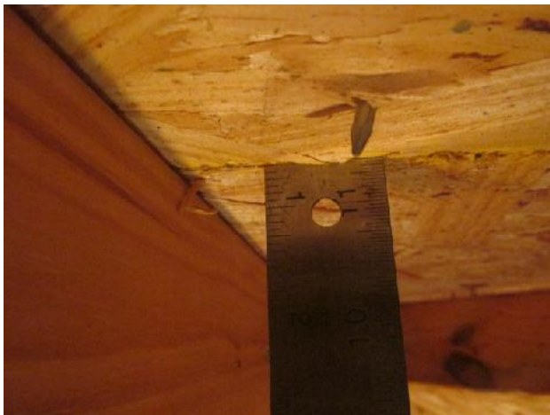
1/2" Plywood (OSB)