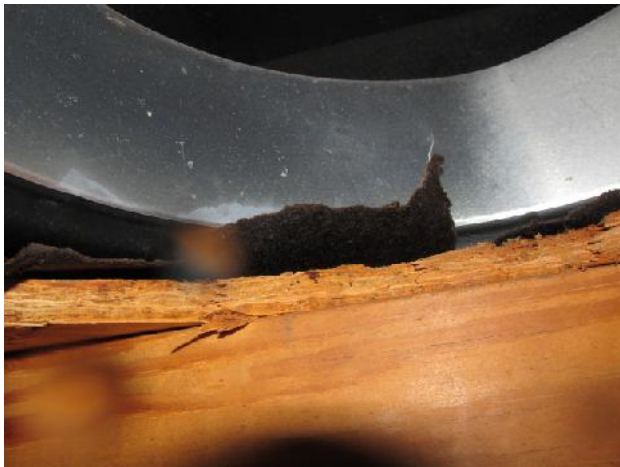
Felt paper - No SWR