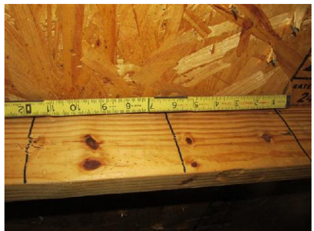
8D Common nails spaced 6" apart