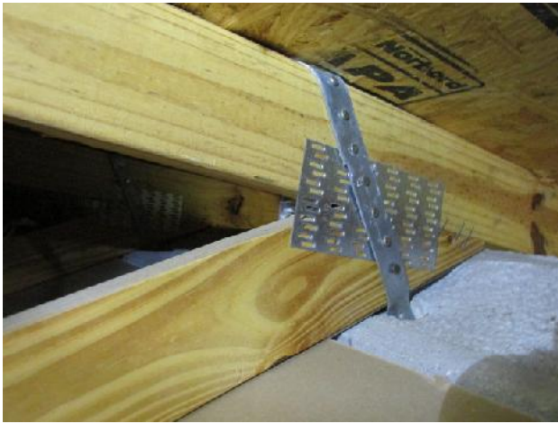
Single strap east of truss